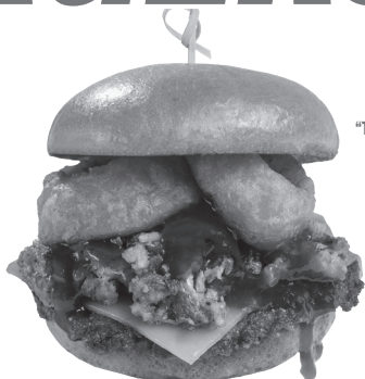
Try "The Big Nasty" Burger!

Fresh cuts of select beef, hand-pressed onto our flat-top grill for that "old-school" crispy-juicy grilled burger "WOW."