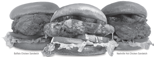
Buffalo Chicken Sandwich