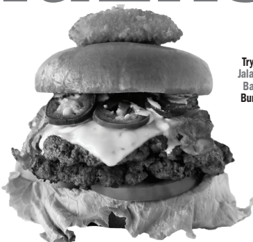
Try the Jalapeño Bacon Burger!

Fresh cuts of select beef, hand-pressed onto our flat-top grill for that "old-school" crispy-juicy grilled burger "WOW."